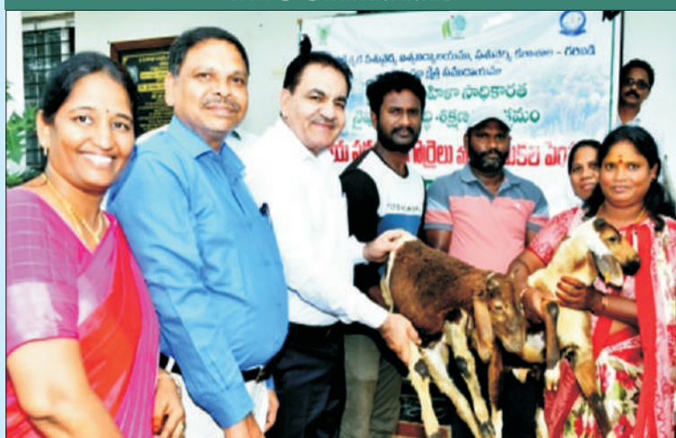
Distribution of Sheep to the Trainees