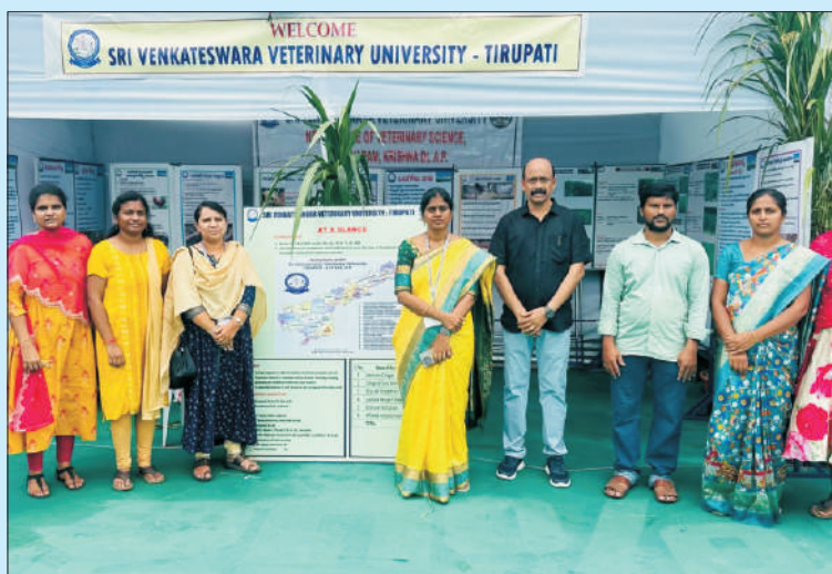
SVVU Stall at Vijaywada Utsav

2. The staff of NTR CVSc, Gannavaram and KVK, Lam organized SVVU stall at Vijaywada Utsav (22 nd September to 16 th November, 2024) and displayed university technologies to the youth and farmers.