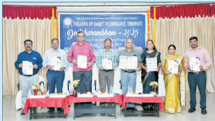
Release of Booklet During Inaugural Session