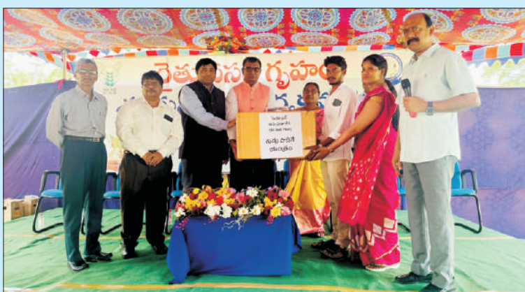
Distribution of Egg Incubator to the Beneficiary