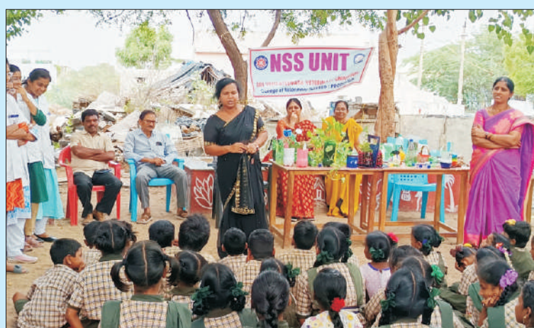
Demonstration of Recycled Plastic Waste to School Children

The NSS Unit of CVSc, Proddatur conducted a plastic bottle and plastic waste collection drive within the college on 11.07.2025 and 19.07.2025 and awareness programme on plastic waste utilization at Govt. High school, Gopavaram village to reduce pollution and promote environmental awareness.