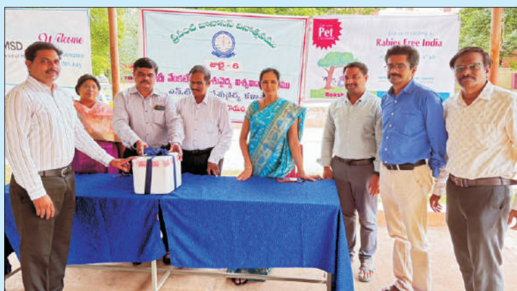
Anti-Rabies Vaccination Camp at NTR CVSc, Gannavaram