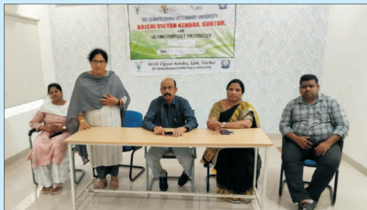
Training cum Method Demonstration on Vermicompost Production