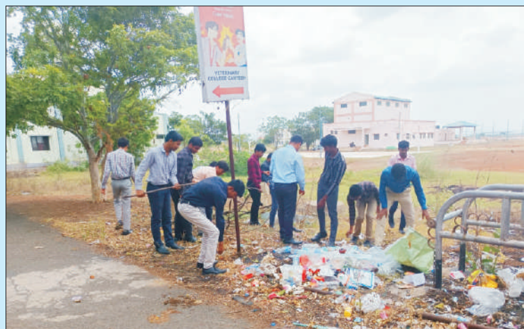
Plastic Waste Collection in College Premises