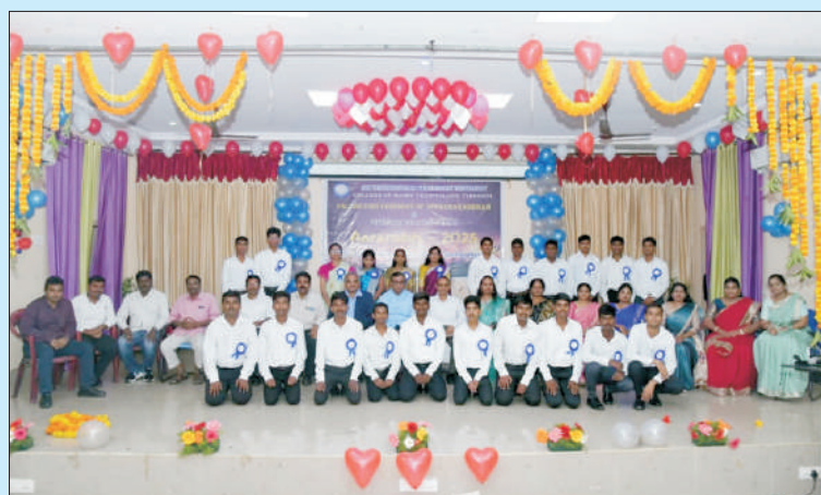
Valedictory Session of the Programme