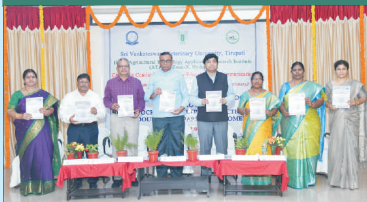
Release of Training Manual by the Dignitaries