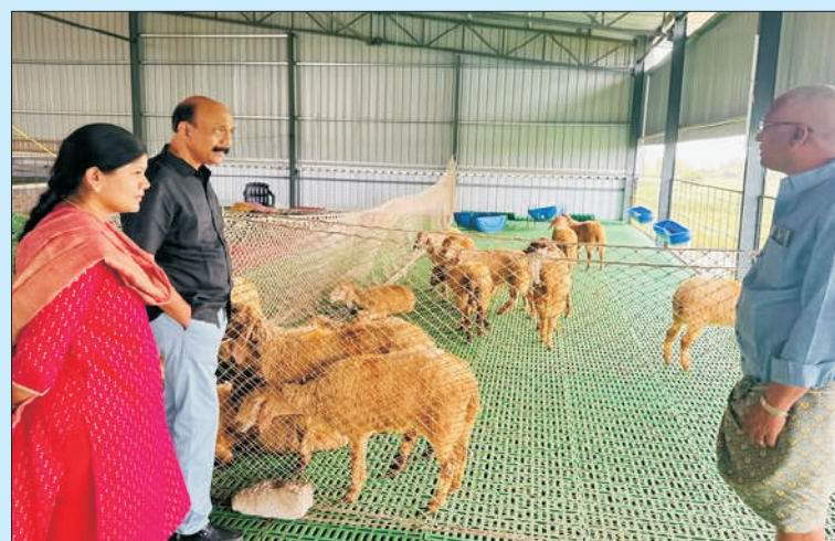
Avishaan Sheep Breed at Beneficiary Farm

KVK, Lam introduced Avishaan, a superior sheep breed developed by ICAR-CSWRI, Rajasthan (a cross of Malpura, Garole, and Patanwadi), to a progressive sheep farmer at Nidumukkala village on 22.08.2025. The breed is known for its exceptional twinning and triplet capacity. Management practices were recommended for successful adaptation and rearing of the new breed in Guntur district conditions.