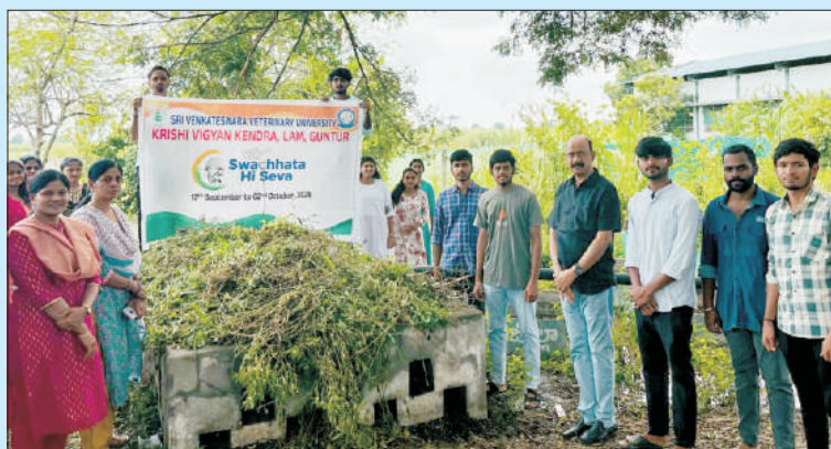
Cleanliness Drive at KVK, Lam

Under the flagship programme of "Swachhata hi Sewa", KVK, Lam conducted several programmes from 17 th to 02 nd October, 2025 including taking swachhata pledge, cleaning of office premises, public places, plantation of trees, conducted rallies and organized completion for students. The winners were