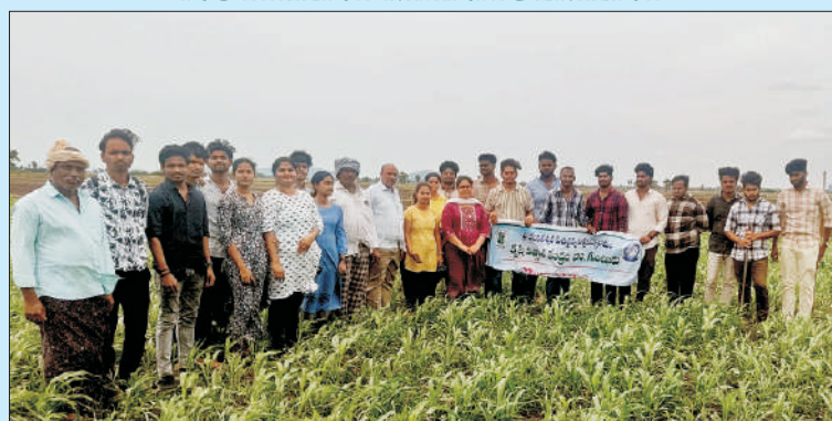
Visit to Fields Cultivated by using Green Manuring