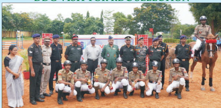
Inter-Unit Horse Riding Competition at NTR CVSc, Gannavaram