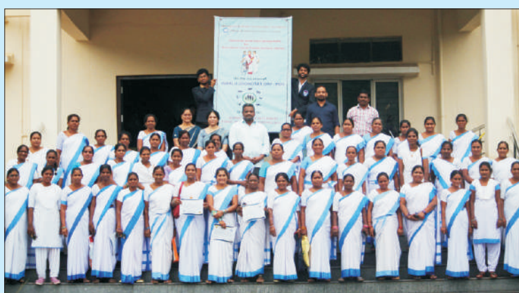
Dept. of VPH, CVSc, Garividi Conducted Training Programme for ASHA Workers Creating Awareness against Zoonotic Diseases

All the Associate Deans of Veterinary colleges participated in the programme and vaccinated the animals at respective colleges.