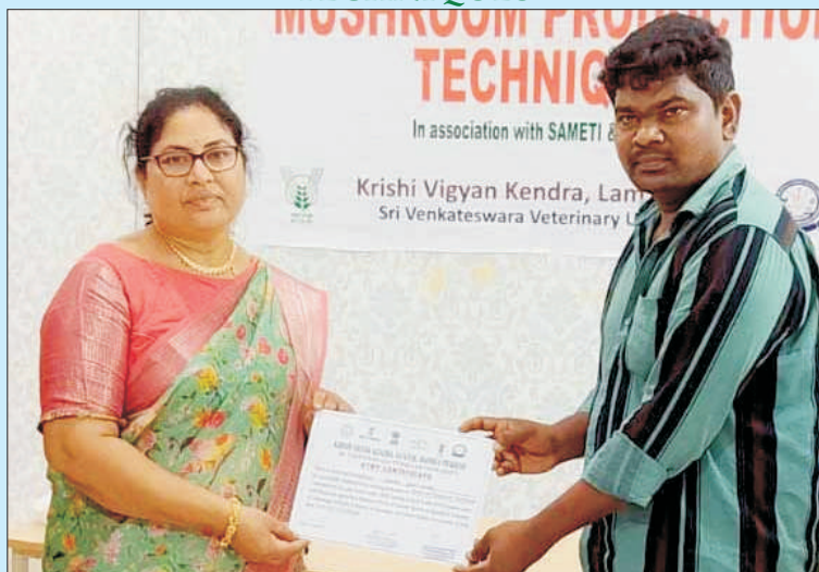
Distribution of Certificates to the Participants

Scientist, Home Science, KVK, Lam on 06.08.2025. She highlighted the critical check points in food handling to increase shelf-life of food and demonstrated millet value added products.