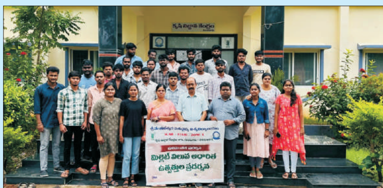
Trainees of Millet Value Addition Training Programme

1. Training on “Milk value Addition” conducted at Ravela village on 13.08.2025. The process of paneer making was explained and importance of milk value addition and whey as probiotic in foods was discussed.