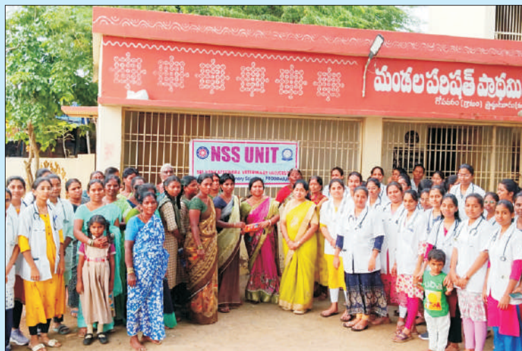
Sanitary Pad Distribution to Village Women

Under Swasth Naari, Sashakth Parivar Abhiyan, the NSS Unit of CVSc, Proddatur organized an awareness programme on menstrual hygiene and nutrition for women at Gopavaram village on 19.09.2025. The session highlighted the importance of proper menstrual hygiene practices, balanced diet and health care in empowering women and strengthening families.