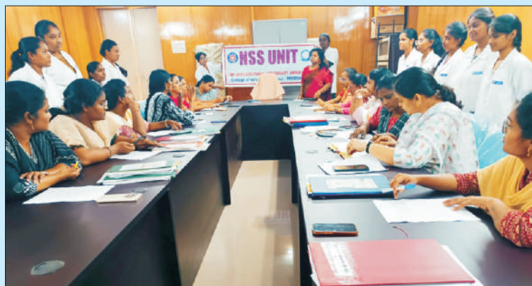
Group Discussion between Female Staff and Students on Safer Work Place

The NSS Unit of CVSc, Proddatur conducted an interactive talk on the theme "Safe Workplace, Strong Workforce" with women teaching and non-teaching faculty on 03.09.2025. The session focused on creating awareness about the POSH Act, ensuring dignity and safety at the workplace and promoting a culture of respect and equality. Faculty members actively participated and shared their views, emphasizing their commitment towards a harassment-free environment.