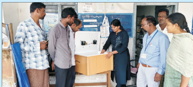
Demonstration of Low-Cost Egg Incubator to Farmers

A method demonstration was conducted at Ravela, Tadikonda Mandal for SC rural youth beneficiaries on 12.08.2025. The session included installation and user guidance for a portable hatchery unit supplied by KVK, Lam. The trainees were demonstrated the technique of setting time-