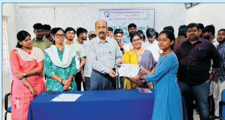
Certificate Distribution to Rural Youth