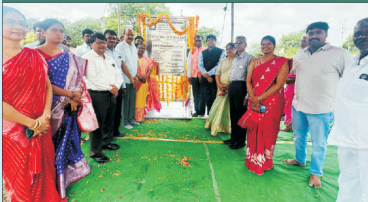
Unveiling of the Commemorative Plaque of Farmer's Hostel