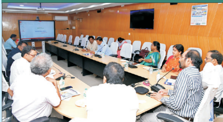
Power Point Presentation on Salient Achievements of SVVU to NAAC Team

NAAC Peer Review Committee visited the SVVU, Tirupati campus from 09.07.2025 to 11.07.2025 for reviewing university grade. They visited all the departments of CVSc, Tirupati, CDT, Tirupati, SLDL, CCVEC and AICRP on Pigs and observed all the facilities at each center. They also interacted with the staff members through online meeting with the NAAC team.