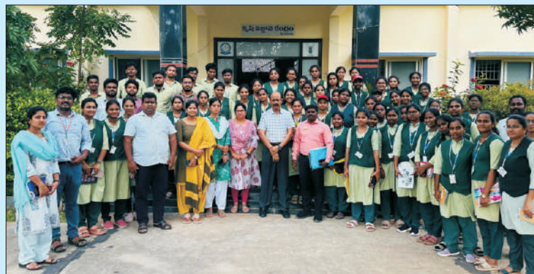
Participants of Training on Natural Farming