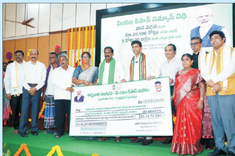
Release of the PM Kisan Samman Nidhi 20 th Installment