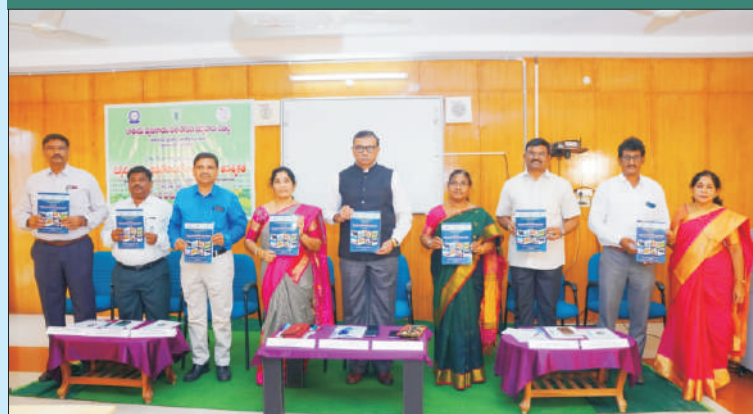
Release of Literature by the Dignitaries