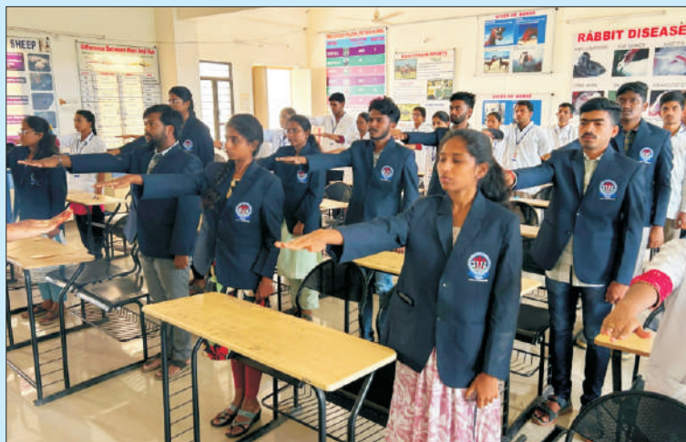
NSS Volunteers Taking Anti-Drug Addiction Pledge

As part of Nasha Mukta Bharat Abhiyan, the NSS Unit of CVSc, Proddatur conducted an awareness programme on "Prevention of drug abuse" on 28.8.2025. Dr. Ch. Srinivasa Prasad, AD, CVSc, Proddatur emphasized that drug addiction not only ruins the physical and mental health of youth but also shatters families and hampers national development. An anti-drug pledge was taken, reaffirming the collective commitment towards a drug-free campus and nation.