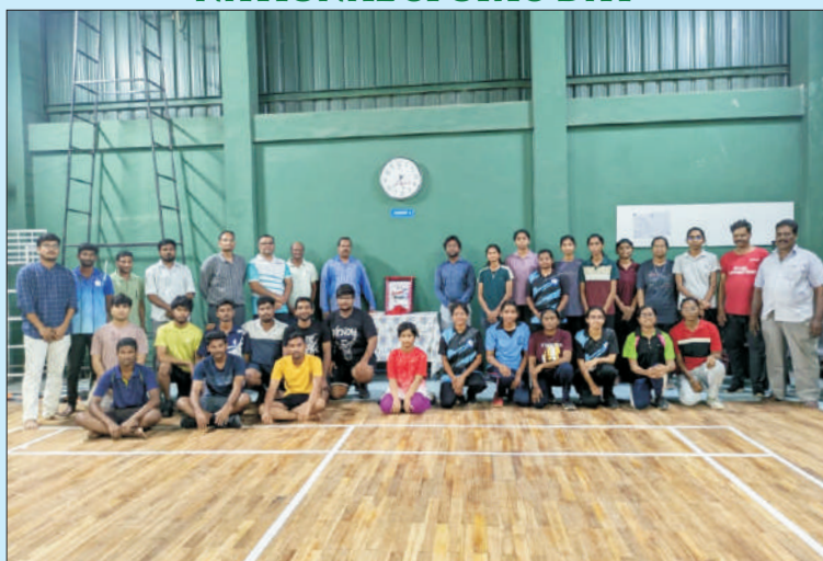
National Sports Day Celebration at CVSc, Tirupati