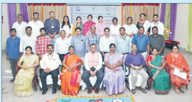
SMSs (Veterinary) along with Dignitaries of Valedictory Session and Organizing Committee