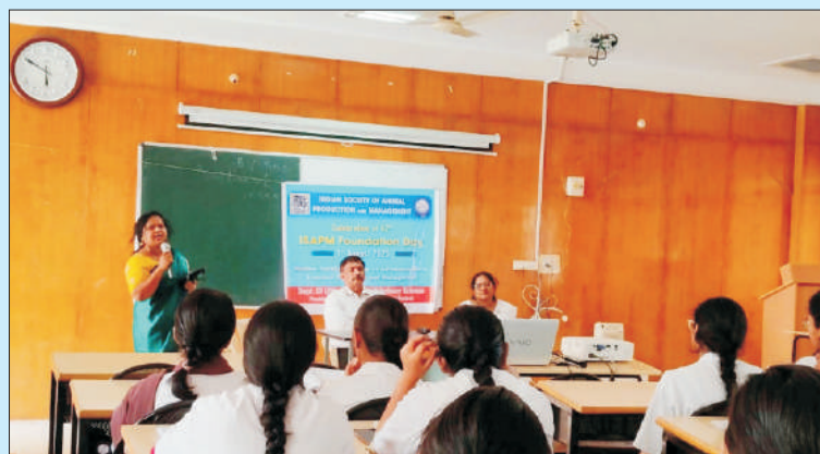
Student-Faculty Workshop Organized by Dept. of LPM