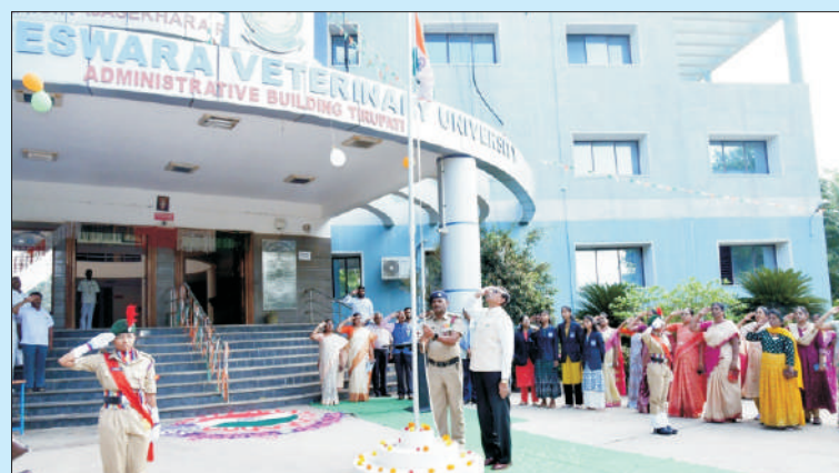
Flag Hoisting at SVVU, Tirupati