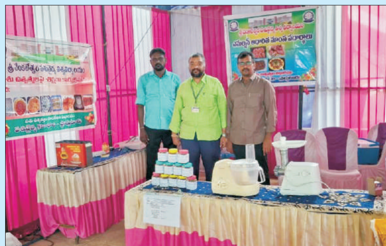
Display of Millet Based Meat Products

1. The Department of LPT, CVSc, Proddatur participated in the "Millet Fair" conducted by KVK, Utukur on 20.09.2025 and organized a stall with millet incorporated meat products for demonstration purpose.